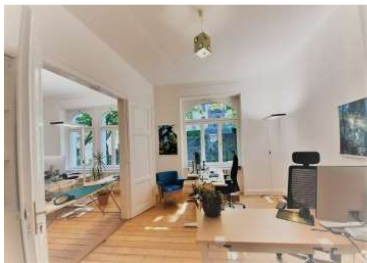
Co-working spaces for our fellows

Comfortable apartments with fully equipped kitchens have been reserved in the university's ' Alexander von Humboldt ' guest house , but fellows are welcome to take up residence elsewhere according to their preferences. They are provided with newly renovated and furnished co-working office/studio spaces at the Panel on Planetary Thinking's headquarters within the city center — inside one of Giessen's most characteristic, old-style buildings.