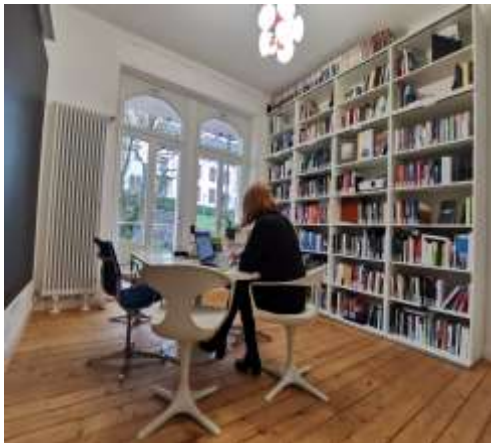
Space Age Lounge and expanding Planetary Library.

Please do not hesitate to contact us with any specific requests. As we work closely with the JLU's international office, future fellows will receive adequate support on any formalities connected to their stay in Giessen (e.g., questions about health insurance or residence permits).